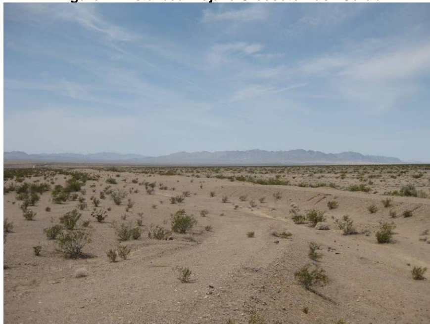
Example of disturbed Mojave creosote bush scrub located at the southern end of the survey site adjacent to the Colorado River Aqueduct. This area consists of spaced shrubs and sparse herbaceous layer.