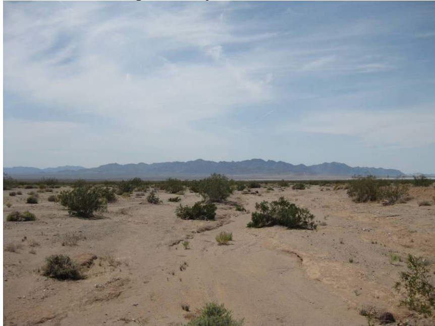
An example of a Mojave wash scrub dominated with creosote bush scrub species..