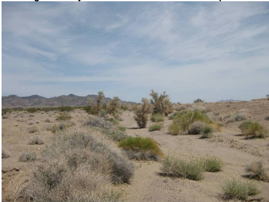
Mojave scrub wash dominated with smoke tree ( Dalea spinosa ), white bursage, and mormon tea, with Mojave creosote scrub in the background