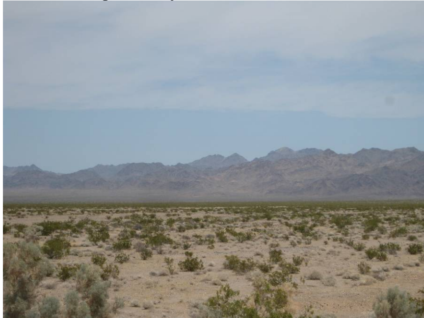
A relatively average and undisturbed portion of Mojave creosote bush scrub.